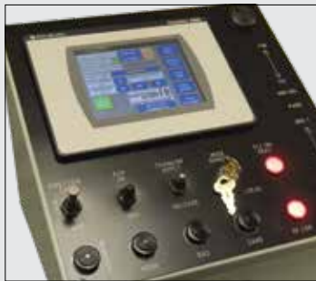
Detail of Load-Out Management console screen

Permanent centralized operational station