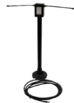
Dipole Antenna Kit