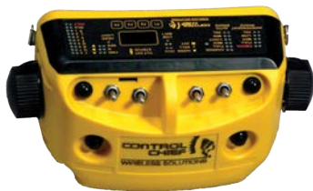
Lightweight OCU BTRR