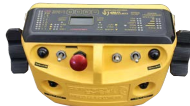
Lightweight OCU BTIND and DBT